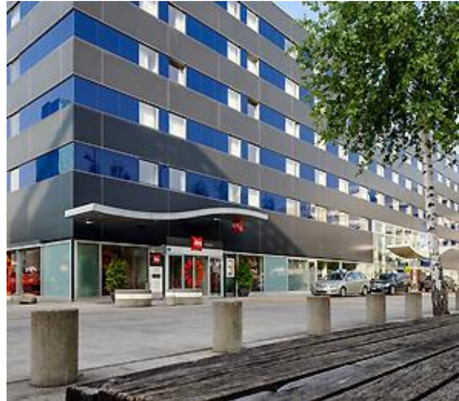
Hotel ibis Zurich City West

The hotel is only a 5-minute walk away from the train station „Hardbrücke“, from where you will get to Zurich main station and the city center in only 2 minutes by train. Hardbrücke is 10 minutes by train from the Zurich International Airport.