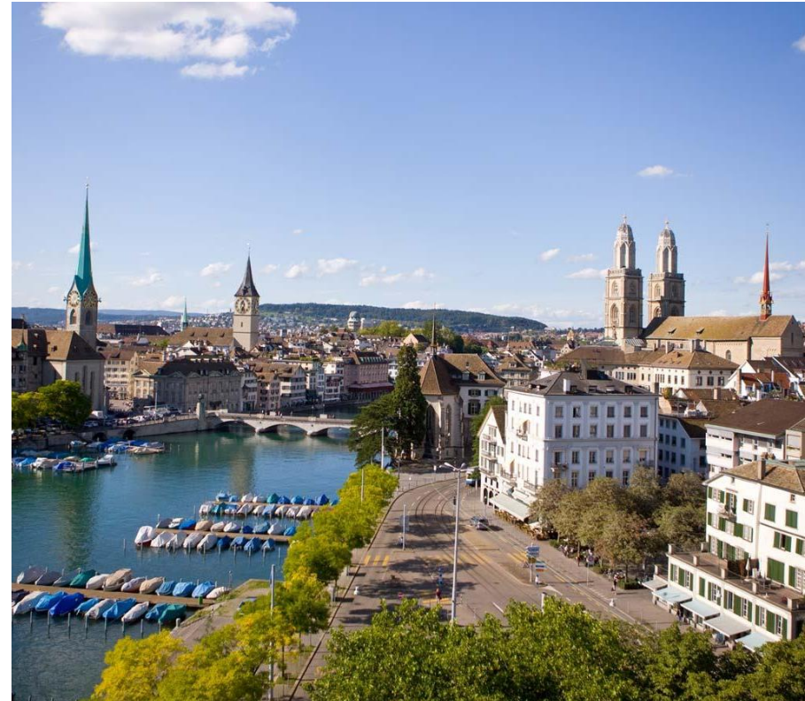
View over Zurich and the river Limmat

Located in the north-central part of Switzerland and at the tip of a lake, Zurich is the country's largest city and counts 1.488 million inhabitants.