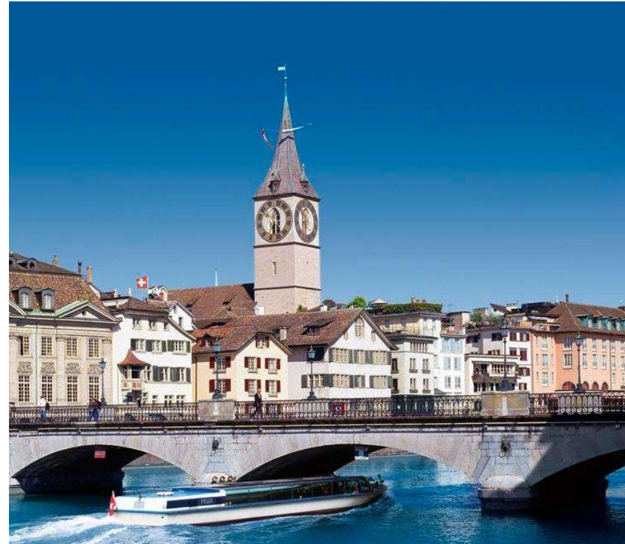
Bridge over the river Limmat and St. Peter church

Culture lovers will enjoy a visit to the museums, Opera House, Schauspielhaus (municipal theater) or Tonhalle (concert hall). Nature fans can take a trip to Zurich's very own Uetliberg "mountain", visit the zoo or board a ship to Rapperswil.