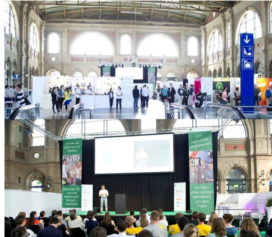
Zurich main station during our trade fair in June 2014

YES will organize public transport tickets for you which will be valid for the duration of your stay in Zurich. Your hotel is only a 2-minute train ride away from the main station.